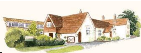
Burghclere Primary School

Burghclere Primary School is set in the rural surroundings of Burghclere village. The School dates from 1838 with most of the original building still in use, with additional accommodation and facilities provided over the years.